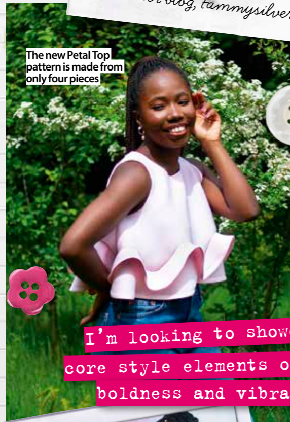
The new Petal Top pattern is made from only four pieces

I'm looking to showcase my core style elements of boldness and vibrancy.